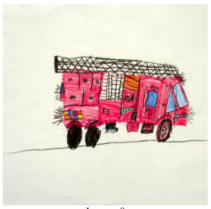
Jon, age 8

This one wouldn't be too bad if the color was kept inside the lines, you picked a new perspective, used non-abrasive colors and asked someone with talent to paint it for you. On one hand I want to give an A for effort but... F