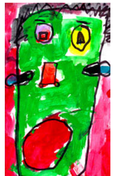
Bryce, age 10

This one wouldn't be too bad if the color was kept inside the lines, you picked a new perspective, used non-abrasive colors and asked someone with talent to paint it for you. On one hand I want to give an A for effort but... F