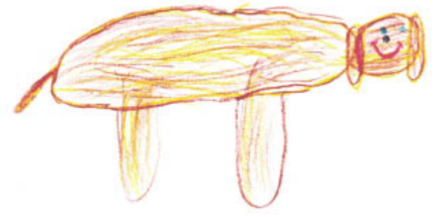
Megan, age 4

If you work in an office with lots of people, chances are that you work with a person who hangs pictures up that their kids have drawn. The pictures are always of some stupid flower or a tree with wheels. These pictures suck; I could draw pictures much better. In fact, I can spell, do math and run faster than your kids. So being that my skills are obviously superior to those of children, I've taken the liberty to judge artwork done by other kids on the internet. I'll be assigning a grade A through F for each piece: