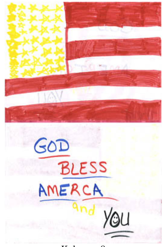
Kyle, age 8

First of all, I don't even know what this is. If it's supposed to be a dog, then it's the shittiest dog I've ever seen. F